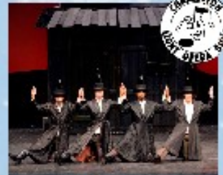
Bottle Dancers Performing a scene From Fiddler on the Roof

$200 per Person - Corporate Tables Available